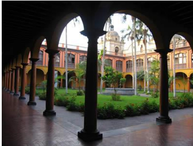
Museum's main patio